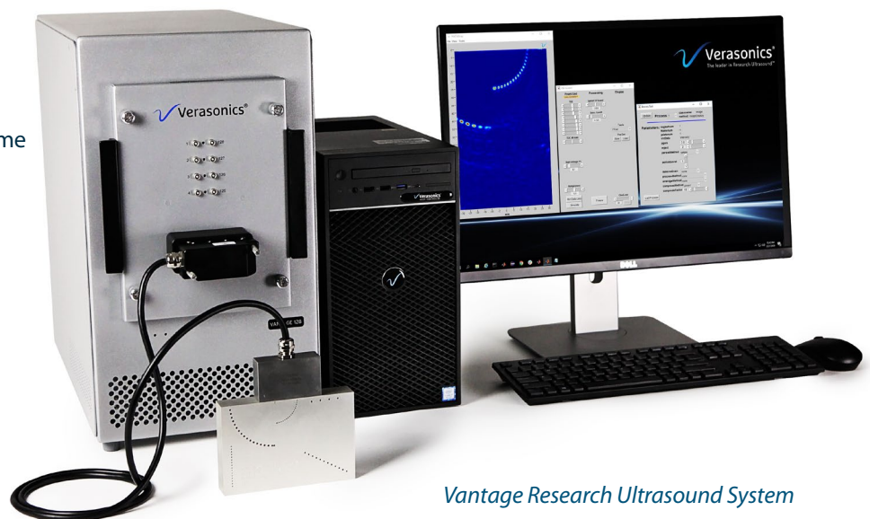
Vantage Research Ultrasound System