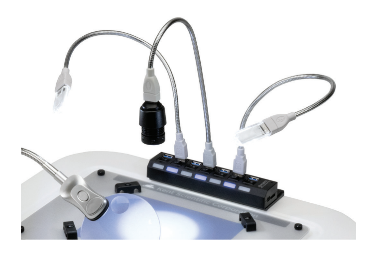
Customize your lighting solution LED lighting plugs directly into the included USB power strip.